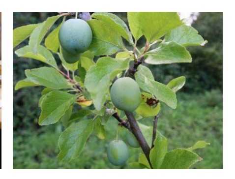
The first six modules will take place at Emerson College. Emerson College sits within a 22 acre Botanic Garden with beautiful ponds, lawns and flower beds, a vegetable garden, an apple orchard and a wood full of blue bells in spring. The experience that greets people is deeply connected to the earth, to the College's roots in anthroposophy and to the contributions of many people over the years.